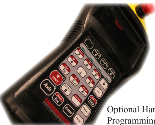
Optional Hand Held Programming Unit.

And, because Thermwood provides all the technology, you have single source responsibility. Thermwood stands behind and supports the entire system and when new technology is available it can easily be upgraded.